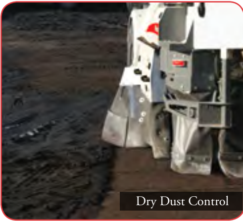
Dry Dust Control