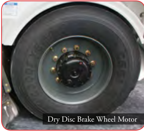
Dry Disc Brake Wheel Motor