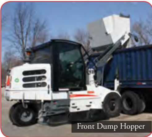
Front Dump Hopper