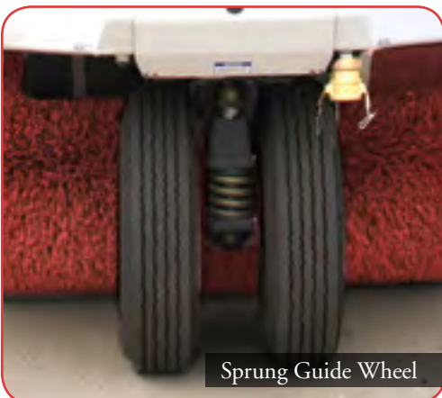
Sprung Guide Wheel