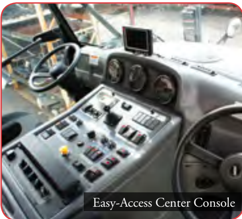
Easy-Access Center Console