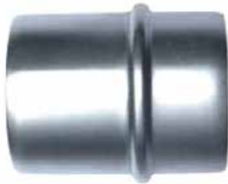
6" Male Plated 6MR