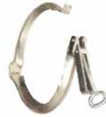
8" Quick Clamp 42594JD