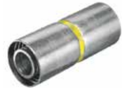
1" Mender, Yellow F16MEND