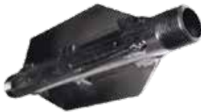
Finned Pipe Weld 1x 34955JD