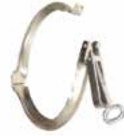
Quick Clamp 16584