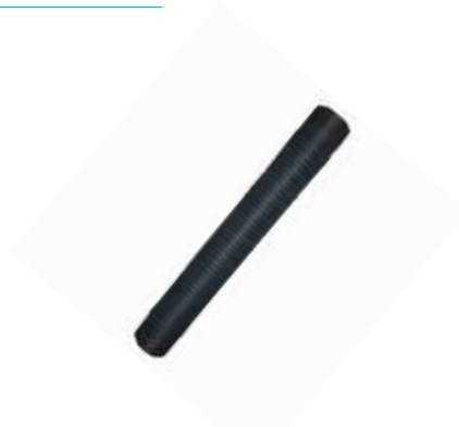
8" x 62" Debris Hose 8x62