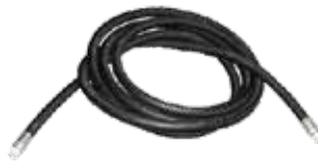
Leader Hose - 1" x 10' 31096BMFJD