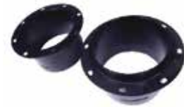
8" Hose End Heavy Duty 58795FJD