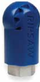
Ripsaw #10.0 1001857-100