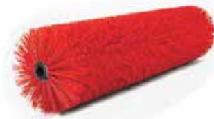
Whirlwind MV, Megawind Poly Center Broom 7873203