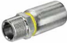
1" Hose End Male, Piranha F16NPT16