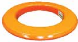
20"-24" Manhole Protection Ring MPR75