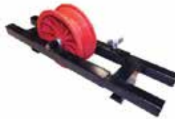
Manhole Top Roller TRP01