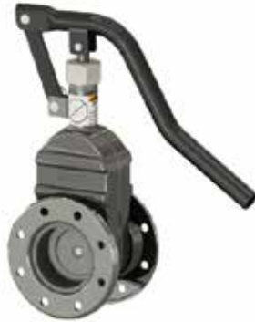
4" CARBON TTMA X MALE NPT SV914MSM