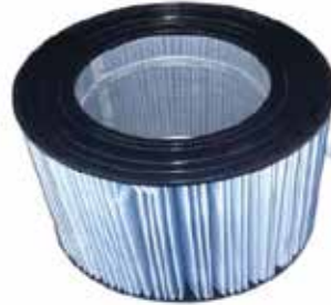
Air Filter, Final Filter 19.6 OD x 14ID x 28.5 Tall 1140363AJD