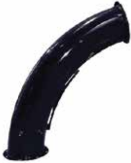
Boom Elbow 27771