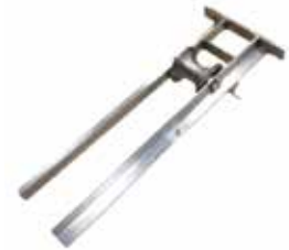
Aluminum Upstream Pulley SAMR-1