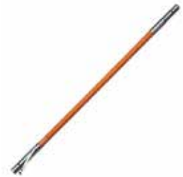
6ft Fiberglass Lowering Pole STD-6