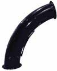
Boom Elbow 27771