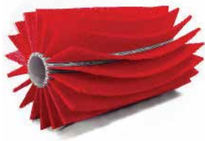
Pelican Strip Broom 7970066